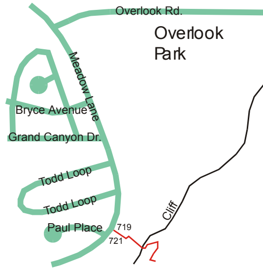
Figure 1: Directions to Gallow's Edge

To get to "Gallow's Edge," park near 719 Meadow Lane in White Rock, being careful not to block mailboxes or driveways (several residents have complained in the recent past). Take the public access trail between 719 and 721 Meadow Lane. "Gallow's Edge" is on the third cliff band below the parking level. Walk almost straight out, but veer left (north) somewhat, and start down the faint trail that leads to the base of the "Old New Place." Take a very faint trail south-east through the talus. When you arrive at the base of the third cliff band you will see several bolted routes. Total approach time should be no more than 5-10 minutes.